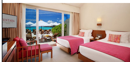
Deluxe Ocean Front Beach Villa (50 2 m)