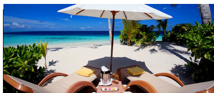
Ocean Front Beach Villa (45 2 m)

Website: http://centarahotelsresorts.com/centara/crf/