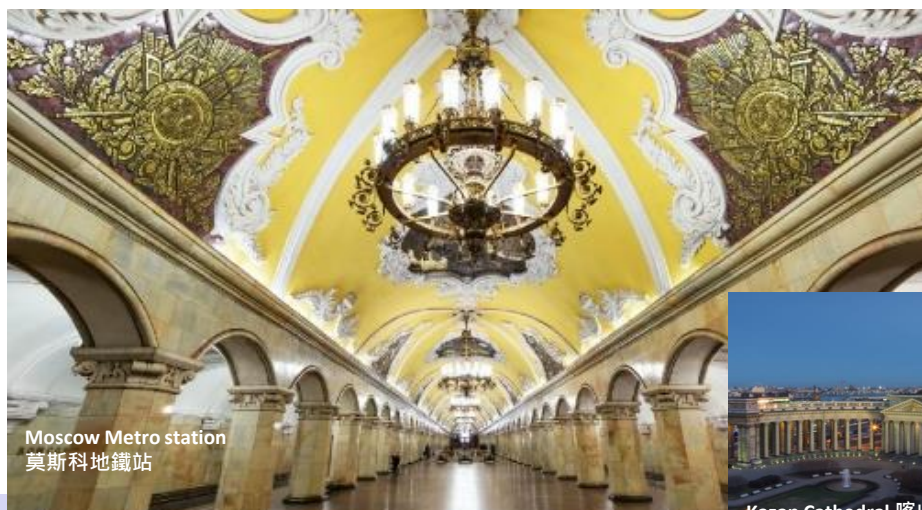
Moscow Metro station 莫斯科地鐵站