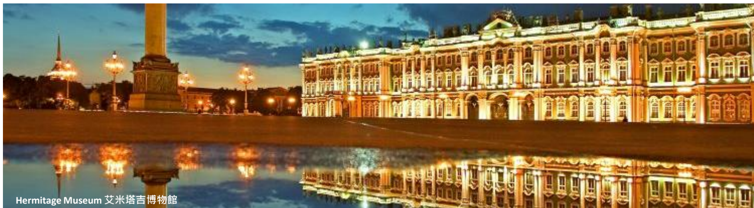
Hermitage Museum 艾米塔吉博物館