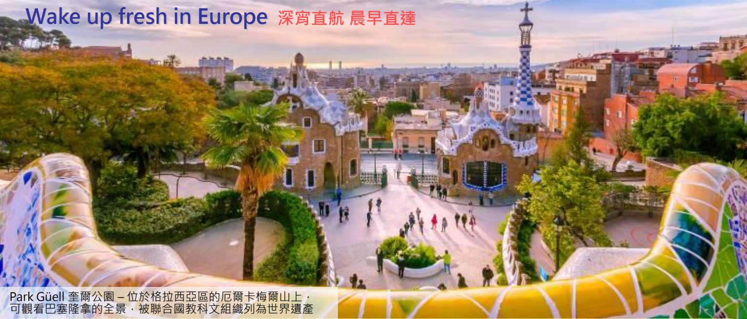
Park Güell 奎爾公園 - 位於格拉西亞區的厄爾卡梅爾山上，可觀看巴塞隆拿的全景，被聯合國教科文組織列為世界遺產